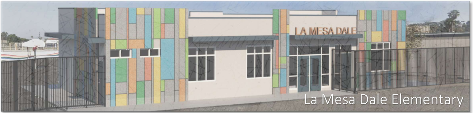
La Mesa Dale Elementary

Bundles C, D, and E project scopes are consistent with the Bundle B projects (infrastructure upgrades, security, landscaping, ADA accessibility, etc.) with a few notable additions.