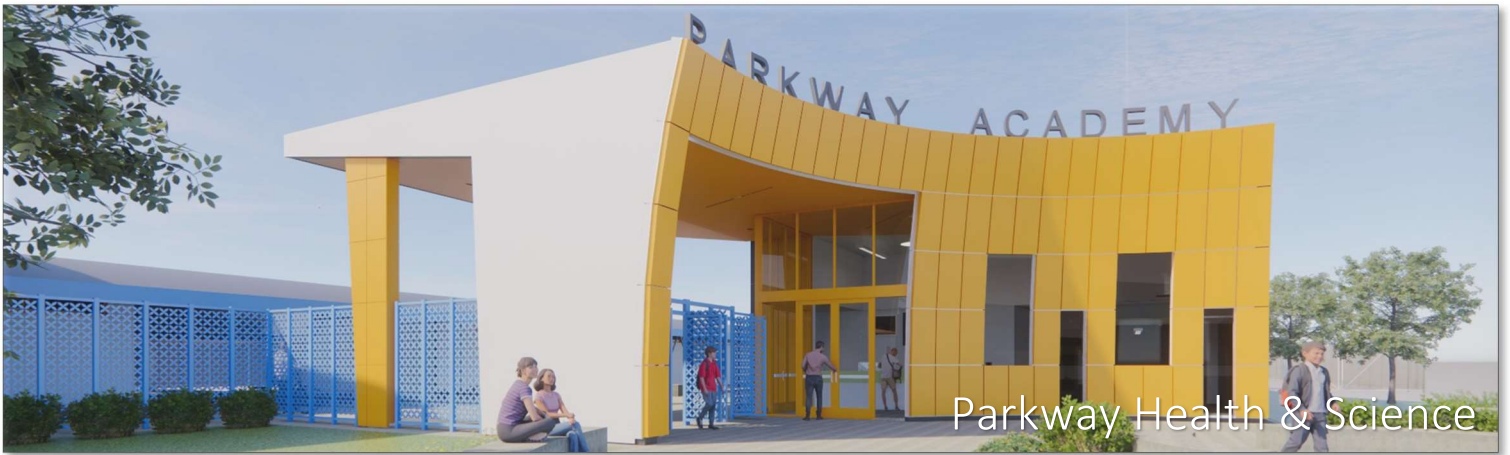
Parkway Health & Science

Construction has commenced on all Bundle D projects. Construction on Bundle E projects is scheduled and will be staggered beginning the summer of 2024 once the DSA approval has been achieved.